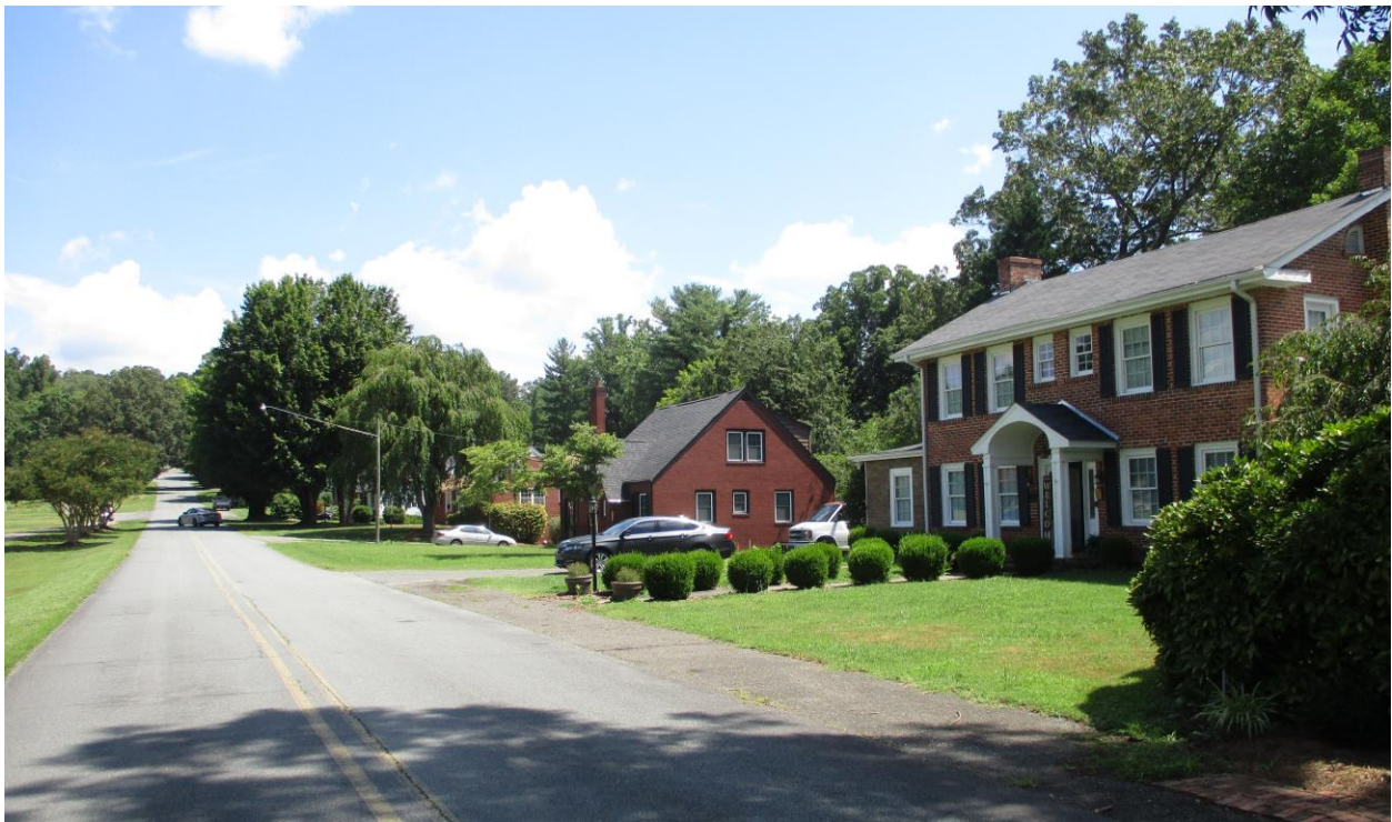
500 block of Country Club Road, view facing north