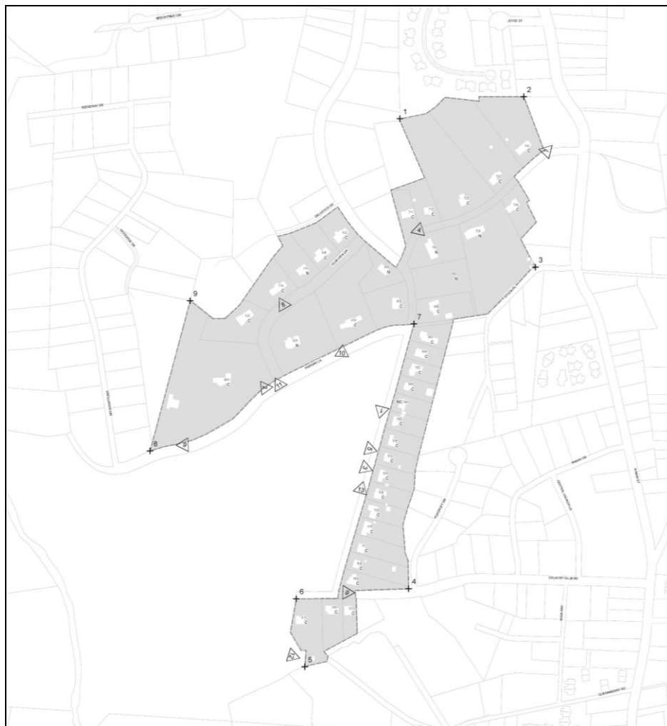
Country Club Estates Historic District Boundary Map