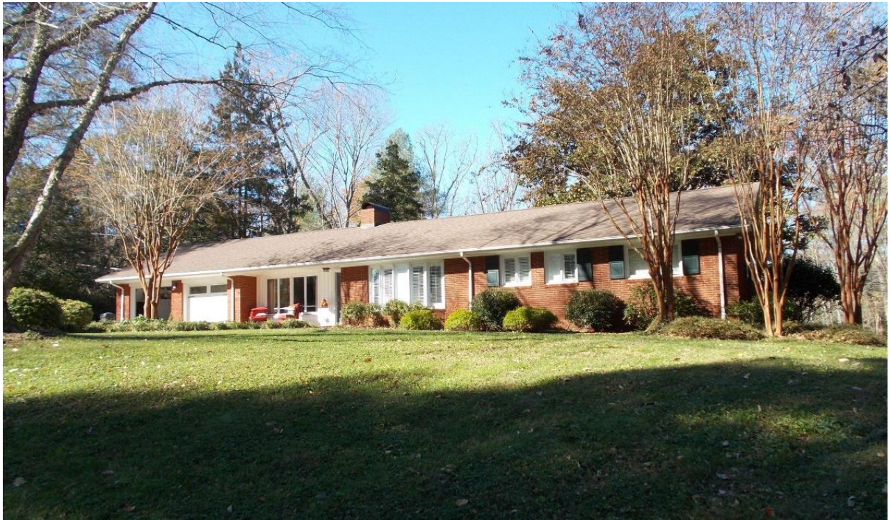
741 Country Club Rd., view facing northwest