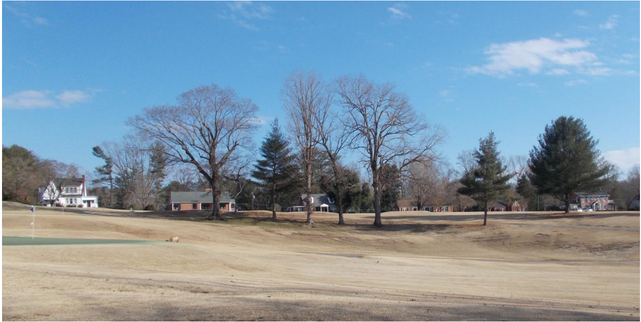
500 block of Country Club Road, view facing east across golf course

Photographs by J. Daniel Pezzoni, November 2018, January 2019, and July 2020