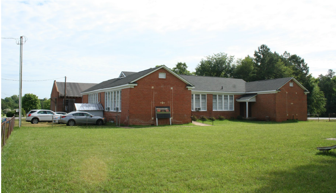
Front façade (south elevation), and side (west elevation) of school, facing northeast