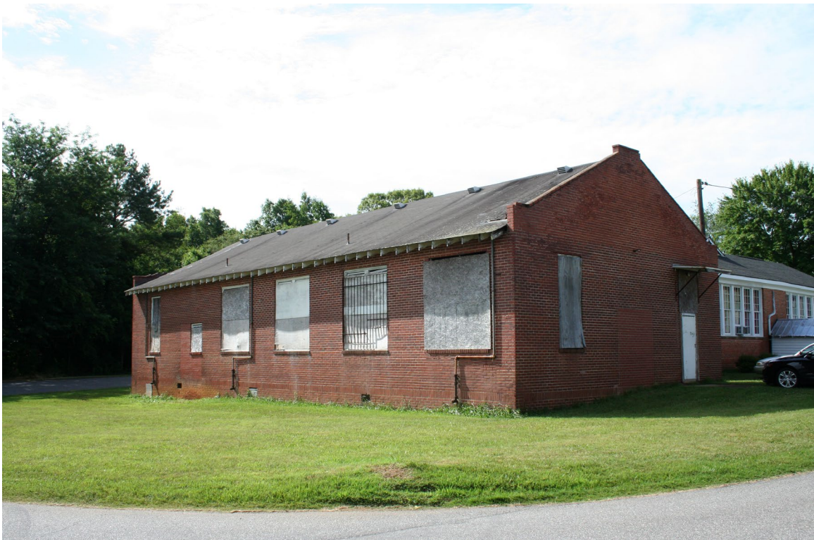
Former auditorium, looking southeast