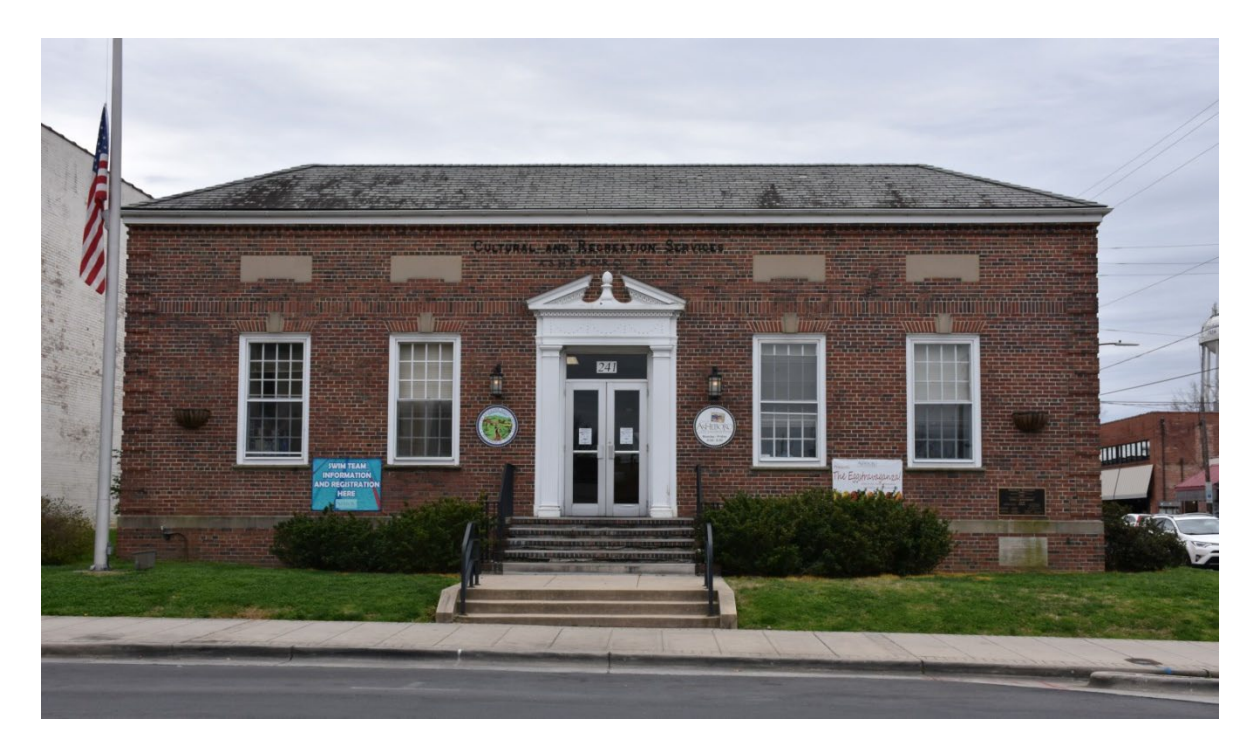
5. U. S. Post Office, 1935, 241 Sunset Avenue (above) 6. Asheboro Municipal Building, 1939, circa 1957, 146 N. Church Street (below)

Asheboro Downtown Historic District Randolph County, NC