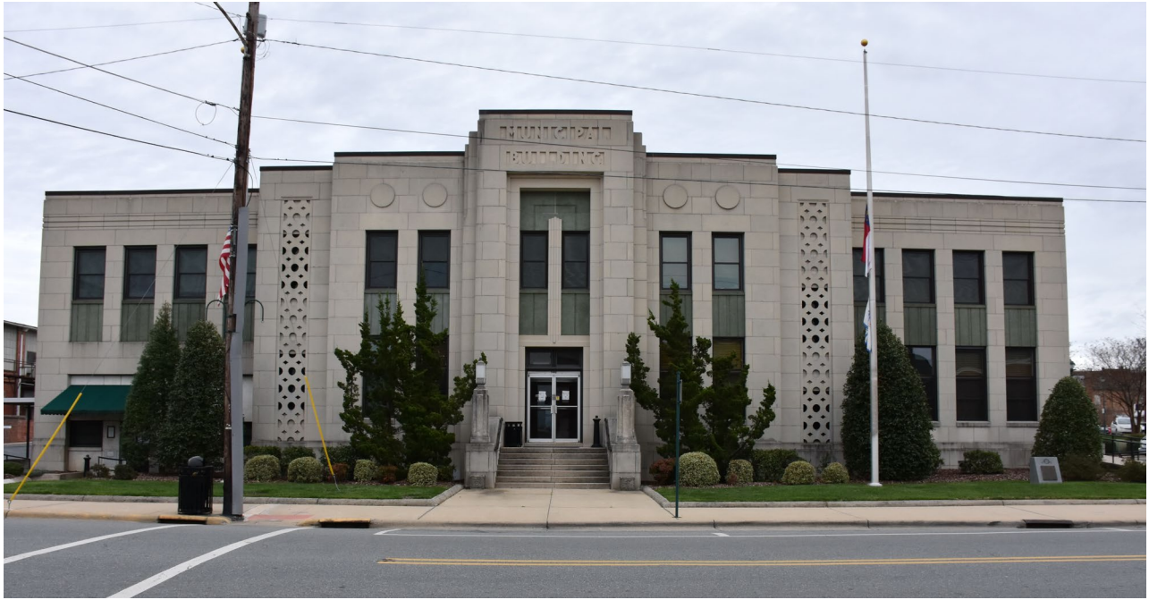
Asheboro Municipal Building, 1939, circa 1957, 146 N. Church Street