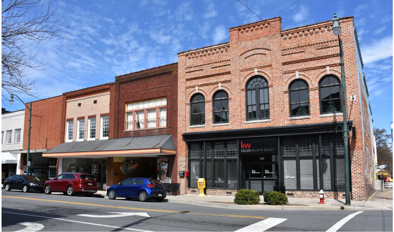
Commercial Buildings, 100 (at right) to 114 Sunset Avenue