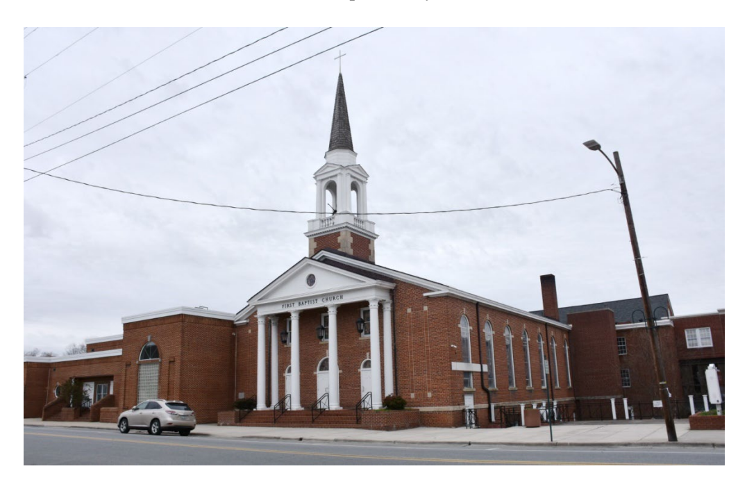
7. First Baptist Church, 1934, 1942, 1961, 1998, 133 N. Church Street (above) 8. Apartment Building, 1935, 318 Hoover Street (below)

Asheboro Downtown Historic District Randolph County, NC