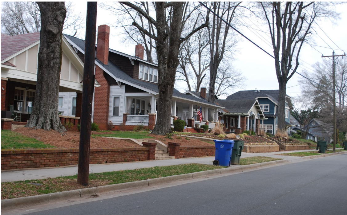
Streetscape view along North Side of S. Academy Street, facing northeast.