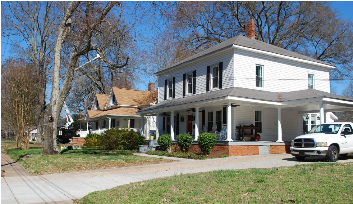
Streetscape view along East Side of W. Center Avenue, facing northeast.

Photographs by Jamie L. Destefano, March 2019