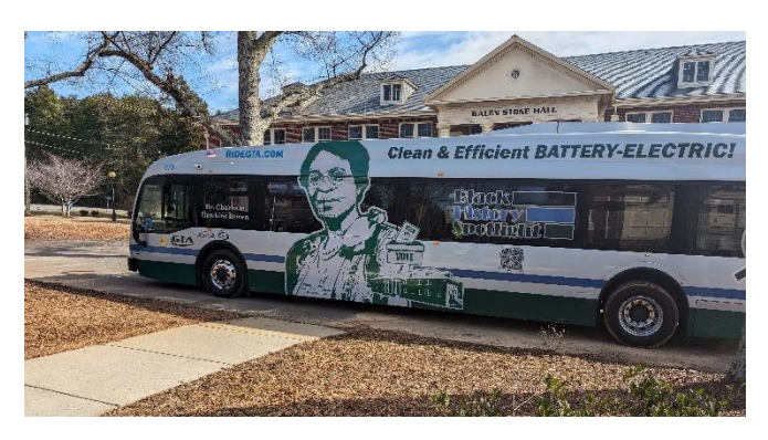
Charlotte Hawkins Brown bus wrap

The Greensboro Transit Authority has selected Charlotte Hawkins Brown for its Black History Month 2024 spotlight. One side of the bus features an image of Dr. Brown, and the other