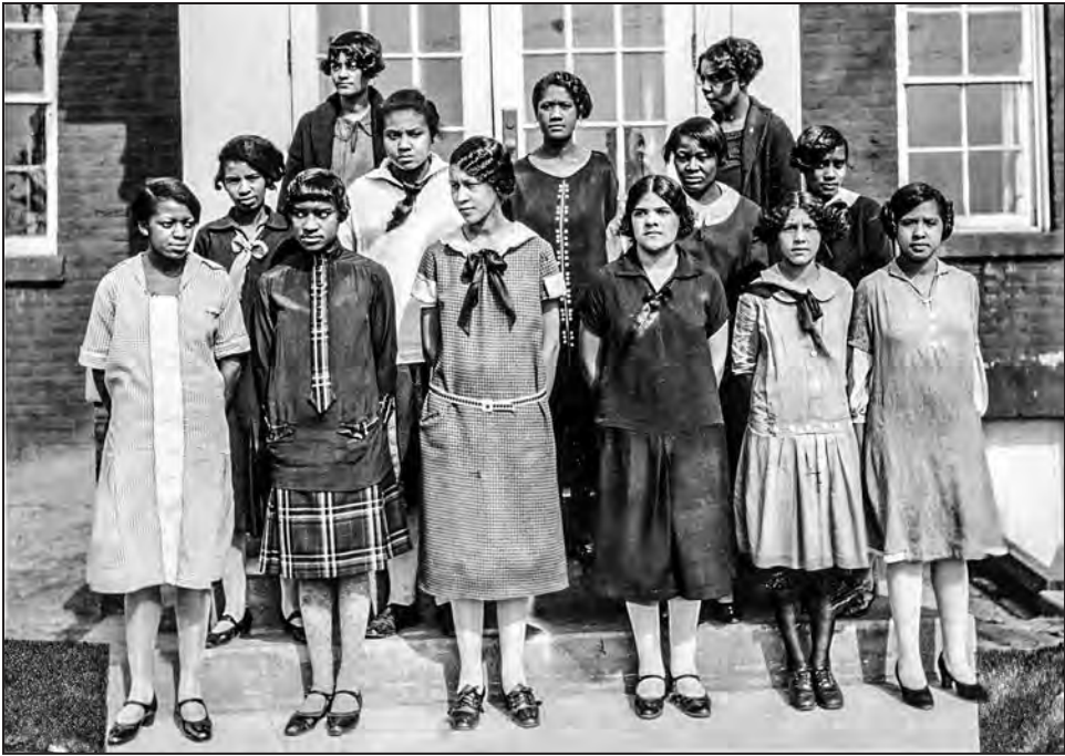
By 1910, North Carolina led the nation in the number of bachelor of arts degrees awarded to African American women. Of the 168 degrees awarded in the state by 1910, Bennett had granted 71. Members of the Bennett College student council, ca. 1920–1929.