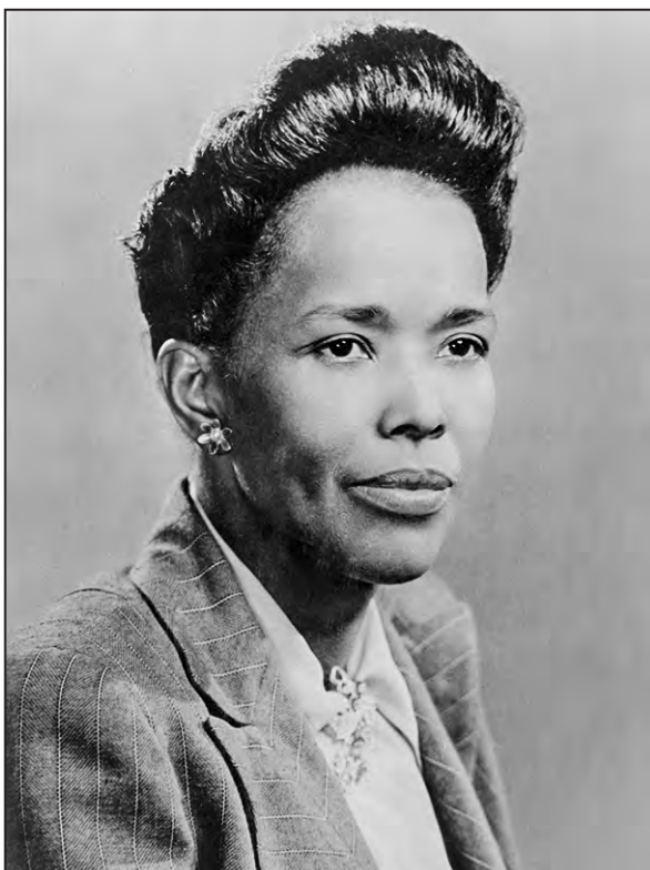
In 1942, Bennett's Contemporary Affairs Committee brought activist, NAACP representative, and community organizer Ella Baker to campus to address the student body. Baker not only promoted the work of the NAACP, she also rallied the young women to envision themselves as agents of change. Portrait of Ella Baker in the 1940s from the Prints and Photographs Division, Library of Congress, Washington, D.C.