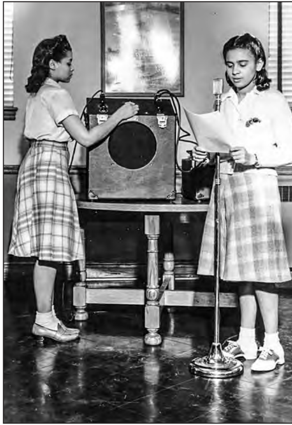
Beginning in the 1940s, Bennett students broadcast a fifteen-minute radio program on Greensboro's radio station WBIG. They delivered uplifting messages that commended the contributions of African Americans and discussed topics such as Carter G. Woodson's Negro History Week and courses on "Negro History" offered at Bennett. Bennett students broadcasting radio program, ca. 1940-1949.