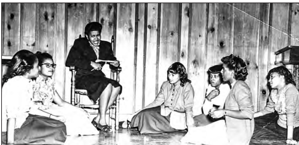
In 1944, a student interracial conference, cosponsored by Bennett and Greensboro College, was held in Greensboro. Delegates at the conference pledged to fight to end segregation in North Carolina's public transportation system. Bennett Belles, nurtured by the school's communitas , carefully considered where and when they might take bolder stands against Jim Crow and white supremacy. Discussion group in Bennett College student union, ca. 1940-1949.

intolerance will not exist." The senior class of 1944 voted the Supreme Court's decision to overturn the Texas white primary in the landmark case Smith v. Allwright as the most important news story of that year. A "Student Interracial Conference" was held in Greensboro and cosponsored by Bennett and Greensboro College, a single-sex school for white females. The conference, which hosted delegates from thirty-four colleges in North Carolina and Virginia, reached its peak when a resolution was drafted that pledged students' dedication to end segregation in North Carolina's public transportation. But the topic most often discussed was democracy. It was debated in class discussions, addressed by visiting speakers, and frequently mentioned in editorials in the Bennett student newspaper. The consensus was that America had failed to extend it fully and fairly to blacks. 53