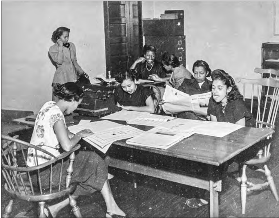
The Bennett Banner regularly featured stories that illustrated students' determination to address social inequality. The newspaper's social and political commentary during World War II reflected the growing support for civil rights organizing and public protests against Jim Crow. Bennett Banner staff, ca. 1940–1949.

However, it was the vesper speaker in March of 1945 that best illustrates how vitally important black colleges such as Bennett were in providing a forum for dissenting voices. Rev. Vernon Johns, described as an eccentric, an iconoclast, a prophet, and the father of the modern civil rights movement, arrived on campus with a growing reputation among southerners looking to break through the color line. Johns broke the mold of the conventional southern black preacher and was known as much for his photographic memory of the Bible and classic literature as he was for entering pulpits with muddy boots “and mix match socks.” At various times, Johns was an itinerant minister, traveling the countryside proclaiming God’s word and unabashedly addressing the evils of white supremacy to those bold enough to extend to him an invitation to preach. He simultaneously inspired awe in his listeners and kept conservatives of all races on edge—having no clue what the radical clergyman would say or do next.