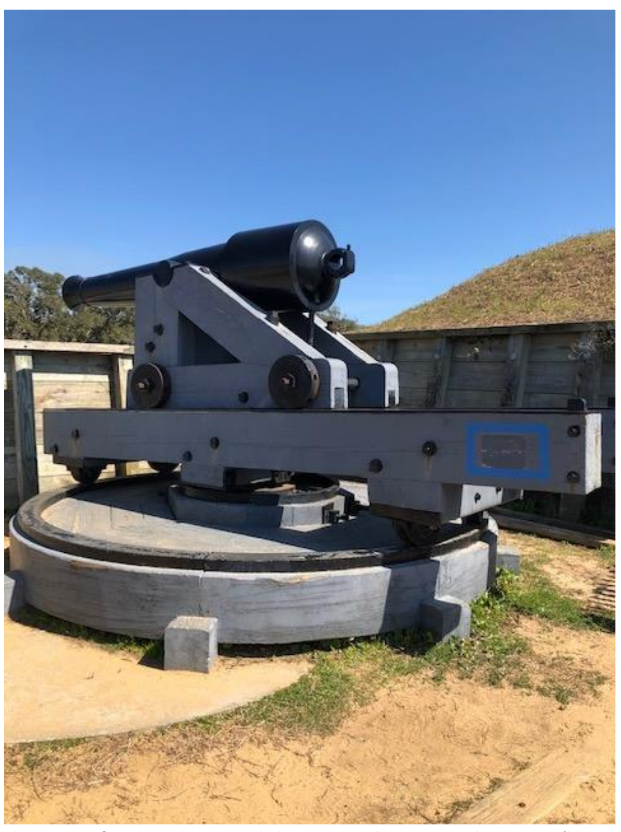
Placement of Paul Laird memorial plaque on replica 32-pounder cannon (blue tape)