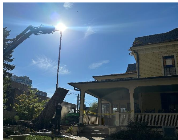
The Thomas Wolfe Memorial, before and after the tree was removed.

As Hurricane Helene approached North Carolina from the south, many historic sites closed as a safety precaution. Several sites in the West Region reported downed trees, power outages, and flooded roads. Vance Birthplace and the Thomas Wolfe Memorial experienced the most adverse effects from Helene. A large silver maple fell against the side of the Thomas Wolfe house, but minimal damage was reported to the interior of the historic