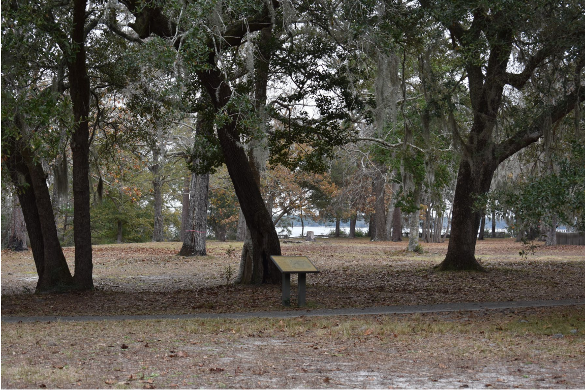
View of the River. The location is approximately 300 yards from the Cape Fear River which is visible through the trees.