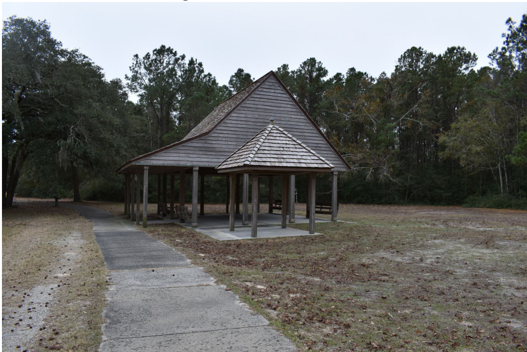
The Pavilion. The art installation will be located on the far side of this structure.