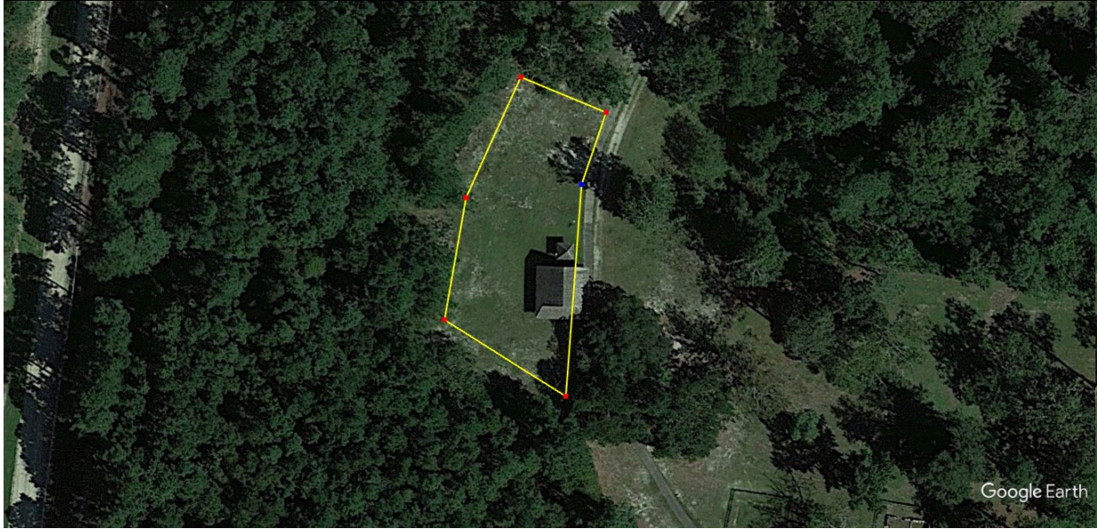
Highlighted Google Earth View of the Impacted Area at Brunswick Town/Fort Anderson. The Africa To Carolina installation area will occupy the open ground below the pavilion.