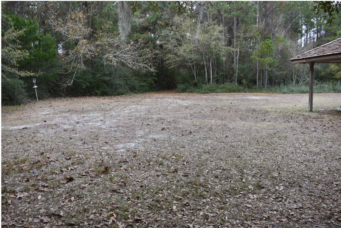
Open Space. The area behind the pavilion was once occupied by an archaeological lab and storage facility.